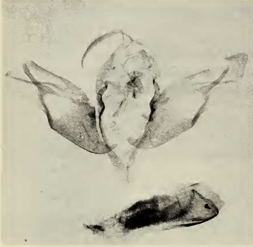
Fig. 1. Male genitalia of the holotype of Ochropleura alcarriensis CALLE & AGENJO, 1981 from Spain, Guadalajara, Trillo, 732 m, 2.IX.1972 leg. J. L. Yela, coll. J. A. CALLE (H. HACKER phot.).